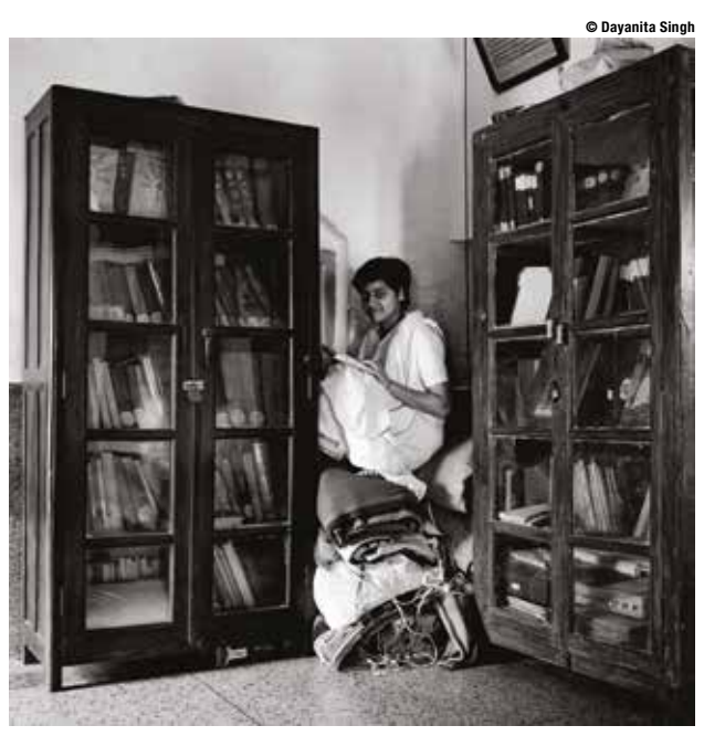
Little Ladies 31 by Dayanita Singh, from Museum Bhavan .

Dayanita Singh was among three photographers shortlisted for the Kraszna-Krausz Best Photography Book.