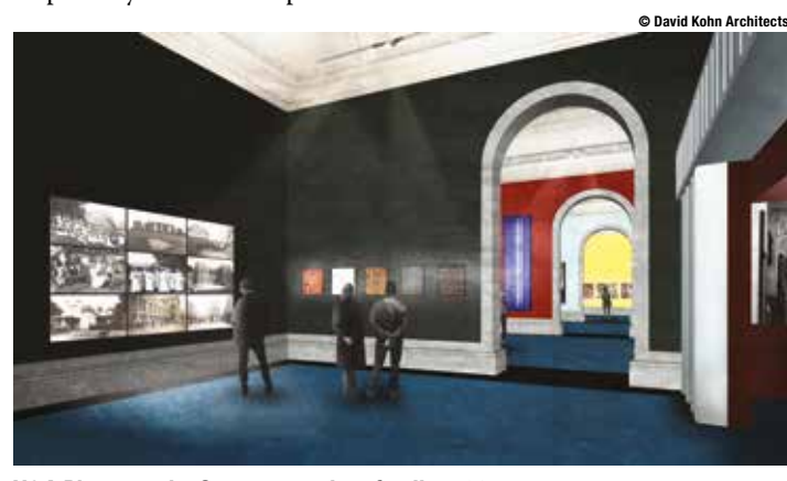
V&A Photography Centre – render of gallery 99.

Photography Centre opens in 2022 and will provide a teaching and research space, library and darkroom.